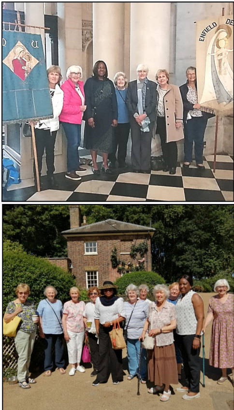
We then looked at the other paintings and artefacts housed at Kenwood before enjoying tea and cakes together in the café and then headed home.

The following week on 12<sup>th</sup> June some of our members attended the Annual Diocesan Mothers' Union Festival at St Paul's Cathedral to celebrate the work of our charity in this country and around the world. This year our branch had the honour of carrying the Enfield Deanery Banner as well as our own banner in the recessional procession.