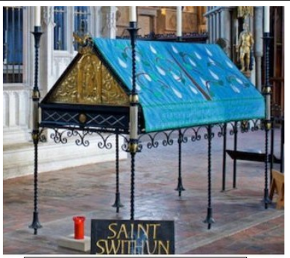
SHRINE OF ST SWITHUN WINCHESTER CATHEDRAL

In summary the life of St Swithun and the stories associated with him encourage us to have faith that God can do anything including bringing the rain when we need it most. Swithun is also an example to us to live simply, showing charity and solidarity to those who need it most. Clearly Swithun internalised and lived out the words of the prophet Micah who wrote: